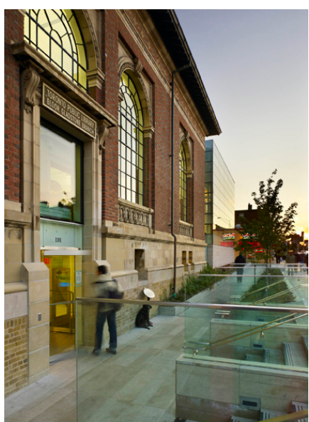
The Bloor Gladstone Library

2014 Governor General's Medals in Architecture - Winner RDH Architects Inc. / Shoalts and Zaback Architects Ltd. (Toronto, ON)